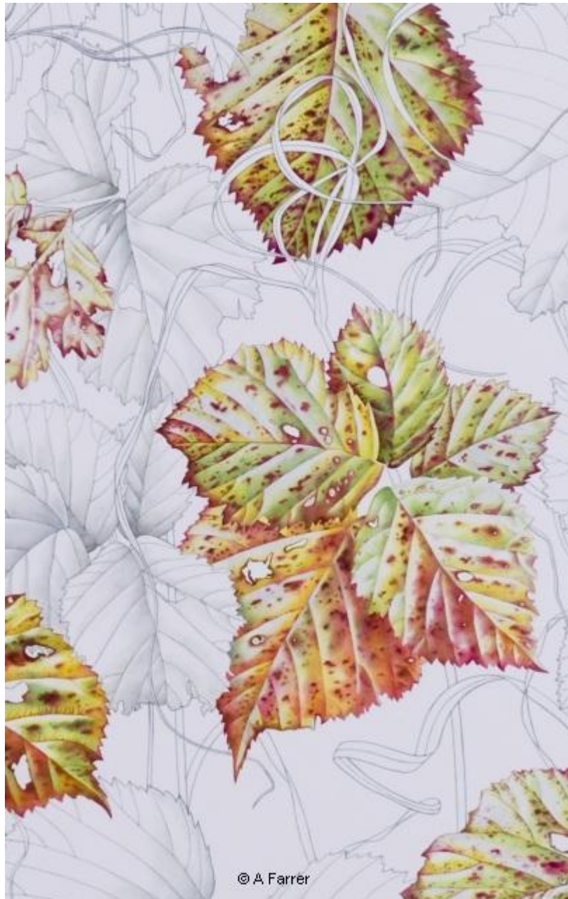
Extract: Bramble - Rubus fruticosus

Bramble leaves and dried grass. The old road to Newby Cote. I have chosen the most dramatic autumn-coloured bramble leaves I could find - they are rarely this bright. I left out the stems because I wanted them to float against the paler grey background