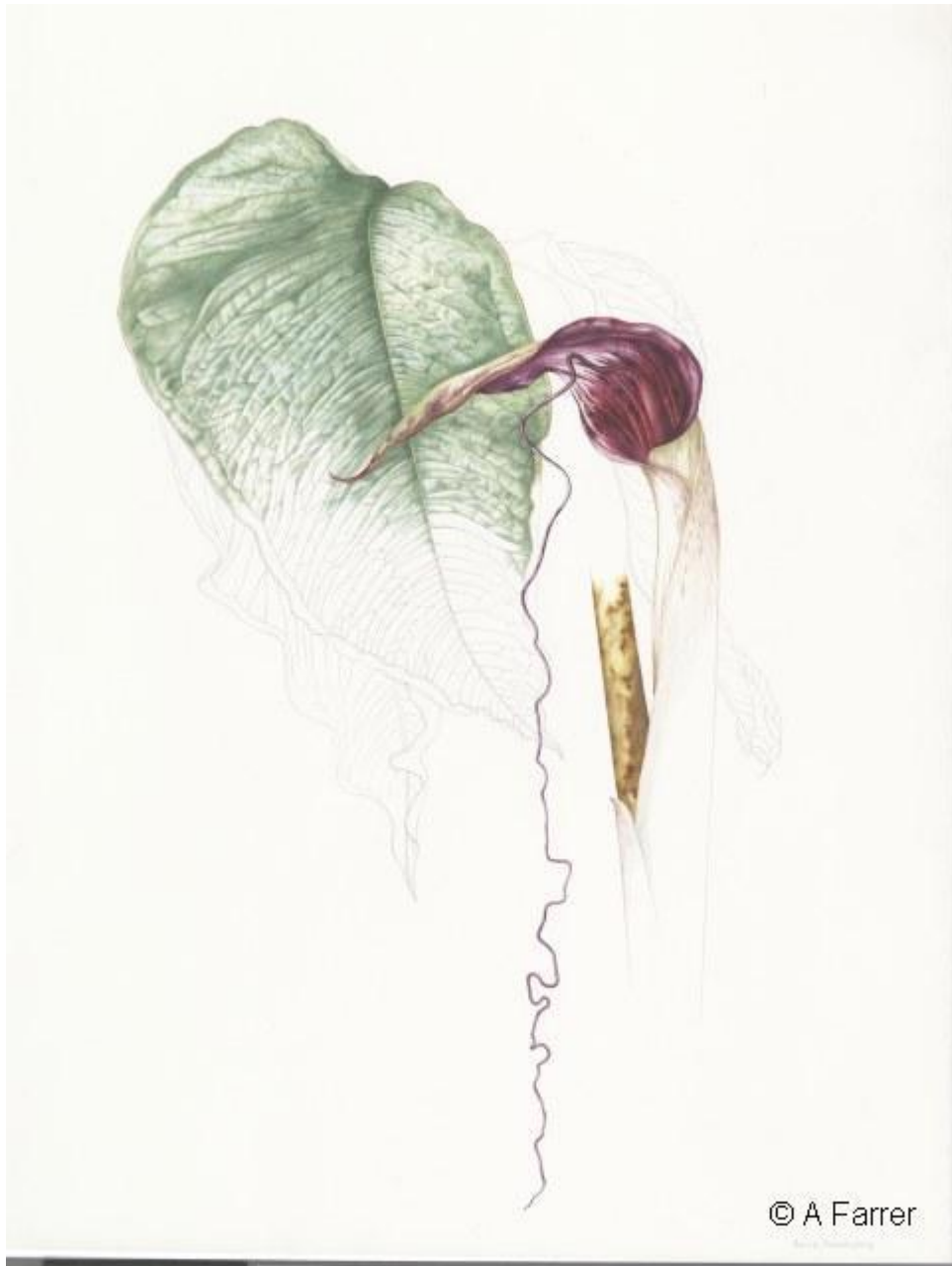
Arisaema speciosum Grows at altitudes of 2,400-3,500 metres in the Himalayas