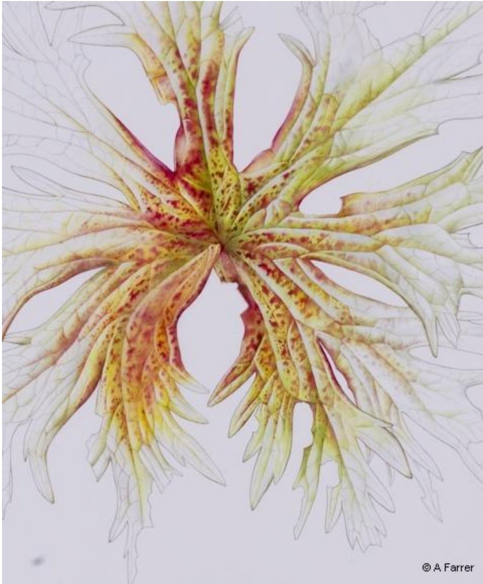
Extract: Geranium pratense

Leaf in autumn colour. The old road to Newby Cote. I have fully painted the central area, putting less paint and 'randomly' less or more colour towards the margin