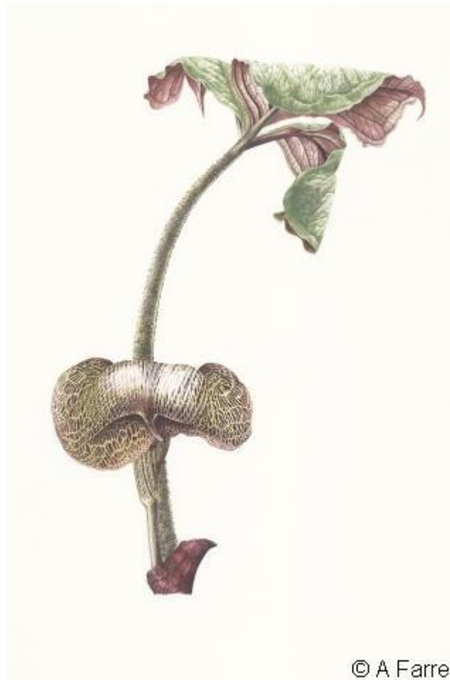
Arisaema griffithii var. pradhanii

Himalayas to draw for a book Flowers of the Himalaya . Thus began a great love for the region to which she has returned 25 times during the last 15 years.